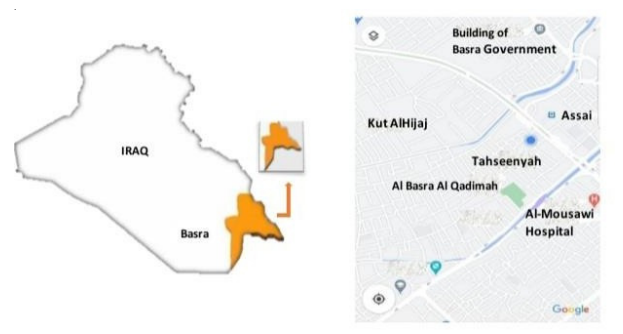
Fig. 2. The locations of studied regions on the governorate center map