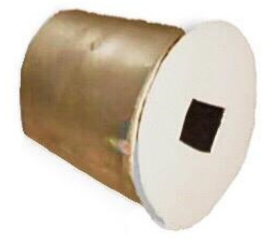
Fig. 1. The cup mode dosimeter employed in this study

years or more by various materials such as cement, sand blocks, bricks and concrete. Most of these items are predicted to participate considerably resources of indoor radon. Derelict places or little used for a long time of occupancy were chosen so as to minimize the ventilation. Dosimeters were hung at elevation of about 2m from the ground, and 1m from roof and walls to keep out the contribution of radon gas released from the houses materials directly. Solid state nuclear track films type CR 39 of size (1.5 x1.5) cm<sup>2</sup> fixed on thick flat cards were subjected in (bare mode). Forty detectors were placed for 90 days starting from 1<sup>st</sup> of March till the end of May 2019. The detectors were etched chemically after eliminating from exposure in 6.25 N NaOH solution at 7 °C for 7 hours, then dried after rinsed by distilled water. The tracks were evaluated by employing an optical microscope with a magnification power of 400X. The gas levels in Bq/ m^3 is calculated from the equation: C= \tilde{n}/t5 >. Where, \tilde{n} is referring to the track density in Tr/m<sup>2</sup>, while, t is the time of exposure, and calculated by day unit. K represent the calibration factor which is used as K=0.188±0.00433 Tr/cm<sup>2</sup>.d per Bq/m<sup>3</sup> according to